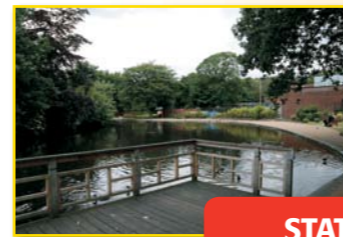
STATIC DISPLAYS ON CORONATION PARK