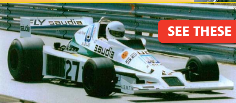
Williams FW06 Grand Prix car

This actual car was driven by Williams works driver Alan Jones, who went on to become World Champion. It recently took part in the Historic Grand Prix at Monte Carlo...now you can see it on the streets of Ormskirk!