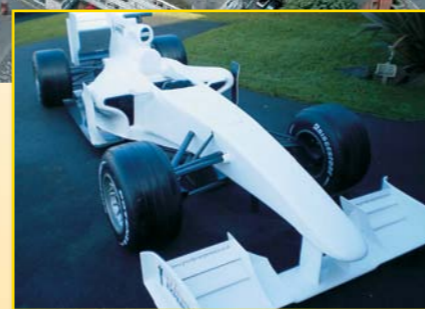
Static Grand Prix car simulator

Your chance to try an exact replica of a modern Grand Prix car for size, and "race" on the world's Grand Prix circuits!